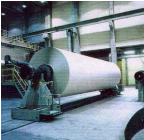
Czech Republic - Oprima Paper

The PQ Secure system is built as a client/server system. With this solution the system can be used both in office, operation centrals and at site in the substations