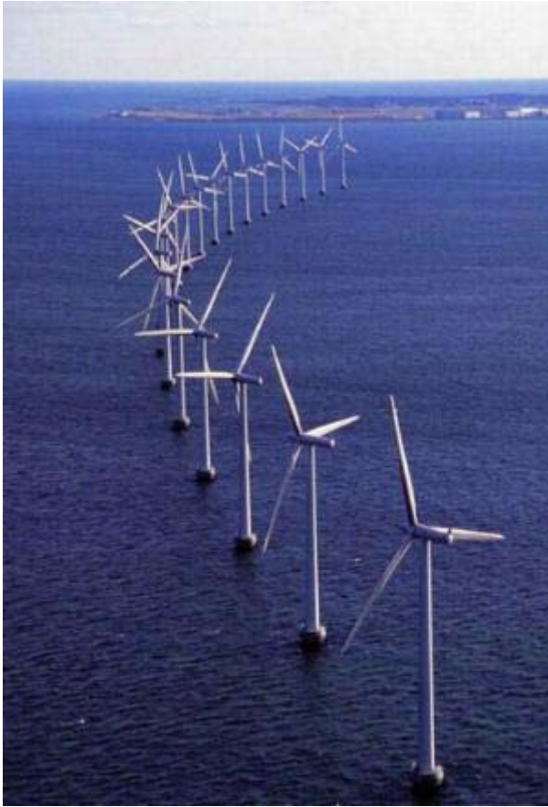
Denmark - Copenhagen Utility