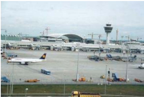
Germany - München Airport

Installation of a UP-2210 measuring unit in a substation, voltage level 40/10 kV. Alingsås Utility is measuring in all main receiver transformer stations and also for specific industrial customers.