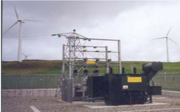
Ireland - ESB