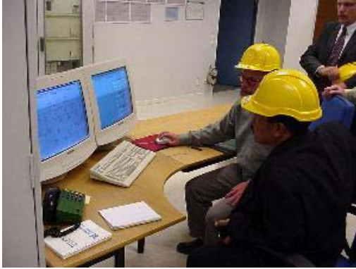
PQ Secure supervision central