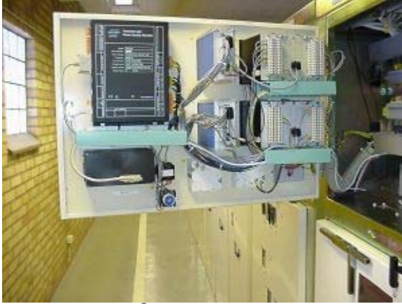
Sweden - Alingsås Utility

Some of the PQ Secure installations around the world are shown below.