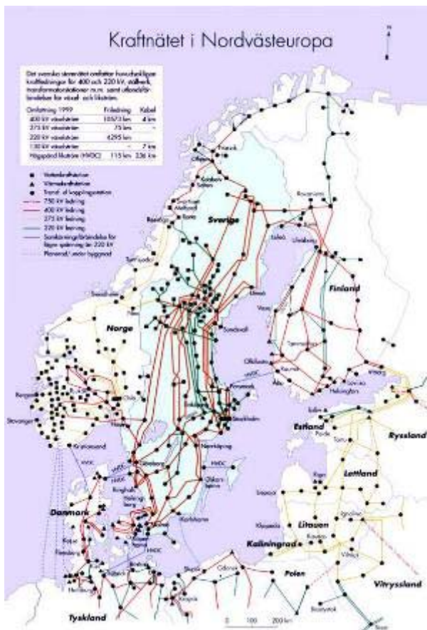
Sweden - Swedish National Grid

Copenhagen Utility uses the PQ Secure system and several UP-2210 units to evaluate the power quality and disturbances that are spread from their wind power plants. Measurements from 690 V up to 130 kV level.