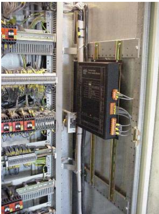
Sweden - Fortum Distribution

Several paper manufacturers use the PQ Secure system for the supervision of power quality. One company is Oprima that use UP-2210 units to measure in their main substation and inside the factory.