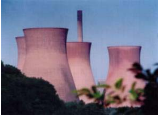
England - Powergen