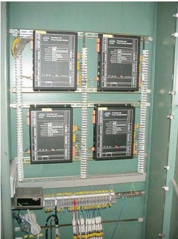
Sweden - Vattenfall Utility

Installation of the PQ Secure system for supervision of several wind power plants at different voltage levels.